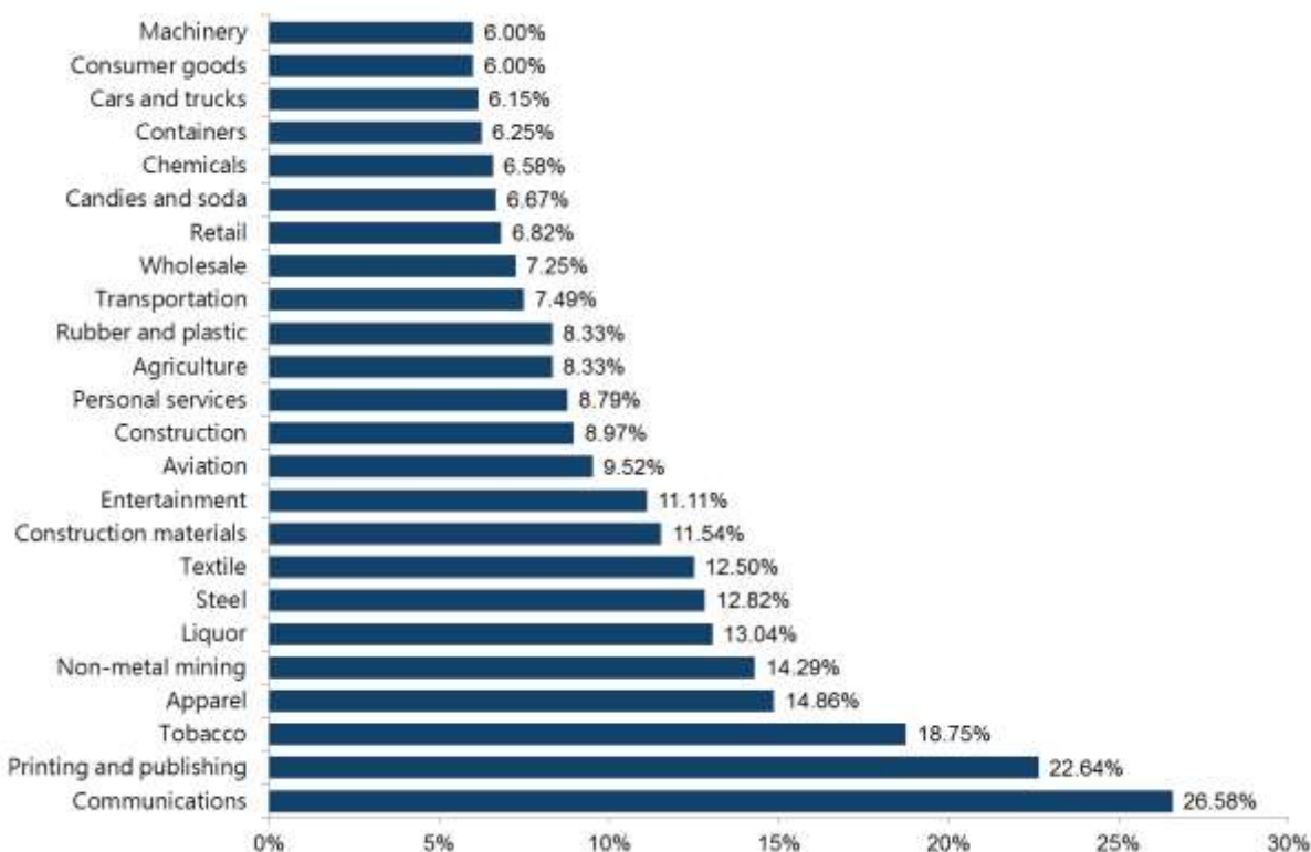
Figure 1. Percentage of US listed companies with DCS structures (more than 6%) in different industries (2010)