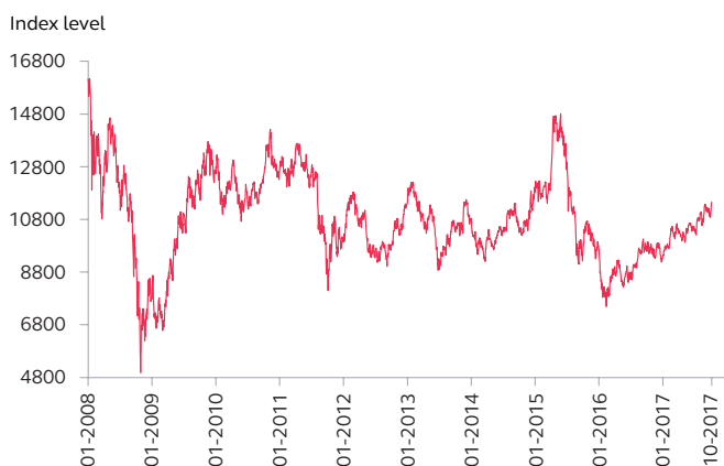
Figure 1: HSCEI Performance from January 2008 to October 2017*

Mini HSCEI futures and options contract were launched on 31 August 2008 and 5 September 2016 respectively to serve the trading and hedging needs of retail investors. Mini contracts are one-fifth the size of standard contracts.