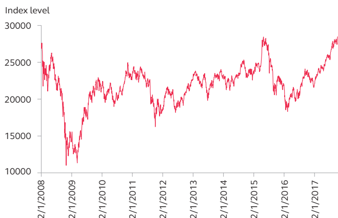
Figure 1: HSI Performance from January 2008 to October 2017*

Mini-HSI futures and options contracts were launched in October 2000 and November 2002 respectively to serve the trading and hedging needs of retail investors. Mini-HSI futures and options contracts are one-fifth the size of standard HSI futures and options contracts.