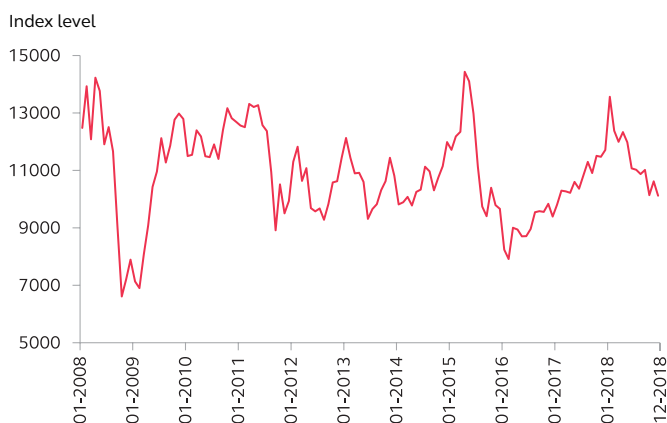
Figure 1: HSCEI Performance from January 2008 to December 2018*

Mini HSCEI futures and options contract were launched on 31 August 2008 and 5 September 2016 respectively to serve the trading and hedging needs of retail investors. Mini contracts are one-fifth the size of standard contracts.