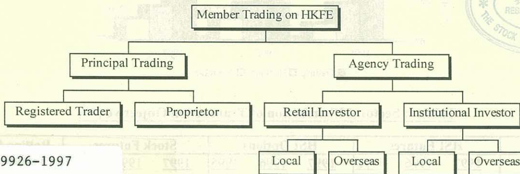
Chart 1: Classification of Member Trading on HKFE

The Members Transaction Survey aims to gain an updated and dynamic perspective of the Exchange's business mix (see Chart 1). Questionnaires were sent to 113 Members doing Exchange business to review their transactions in the HKFE's futures and options markets during 1 July 1996 to 30 June 1997 ("1997"). A 100% response rate is achieved. The survey unveils the latest development 3 on patterns and distributions of Members' trading in HSI Futures, HSI Options, Stock Futures and Rolling Forex markets.