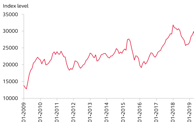
Figure 1: HSI Performance from January 2009 to May 2019*

Mini-HSI futures and options contracts were launched in October 2000 and November 2002 respectively to serve the trading and hedging needs of retail investors. Mini-HSI futures and options contracts are one-fifth the size of standard HSI futures and options contracts.