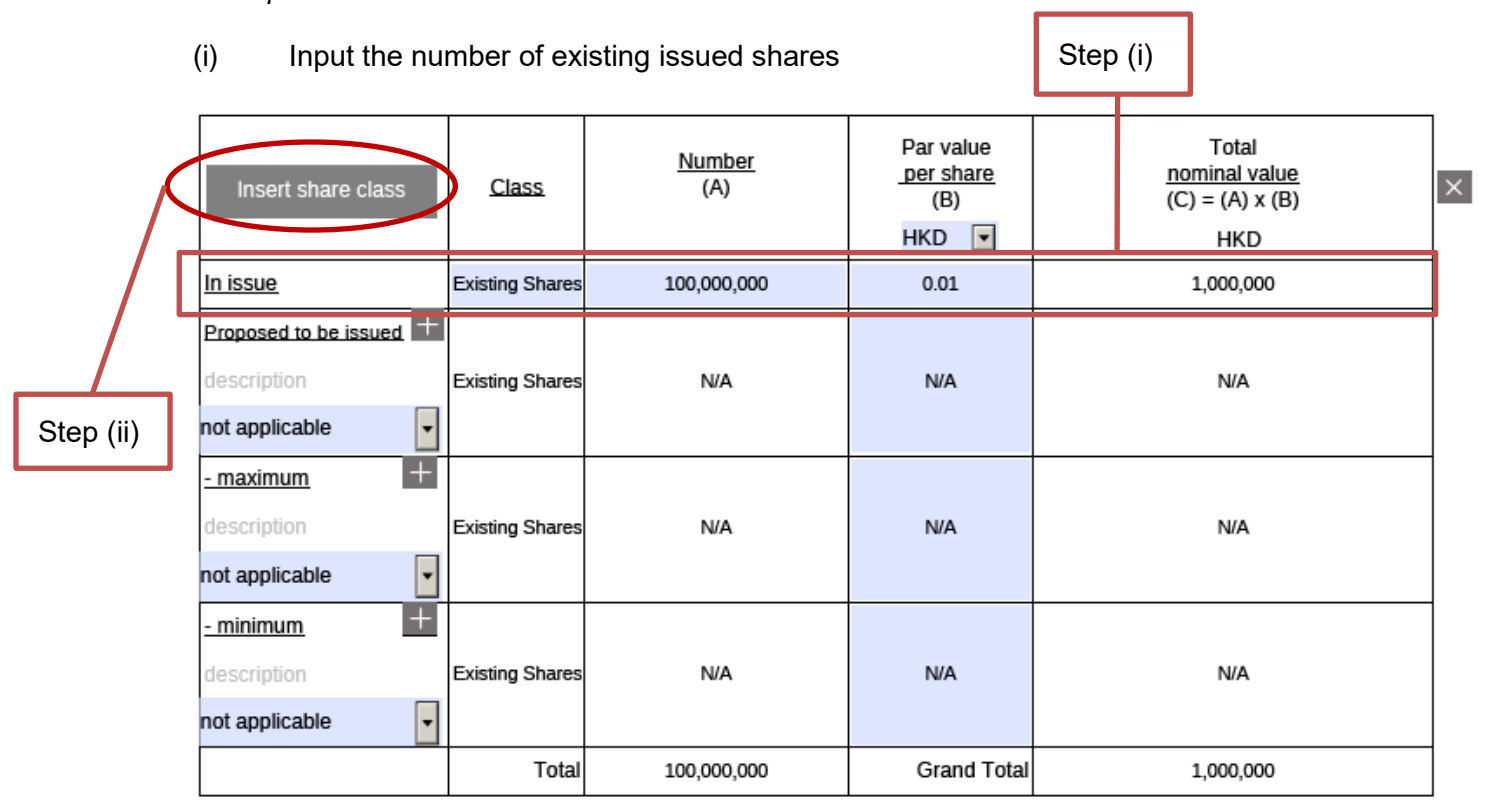
Example 1: Share consolidation

(ii) Insert a new share class and input the number of issued shares upon completion of share consolidation. Provide details of the share consolidation in the description box below the table.